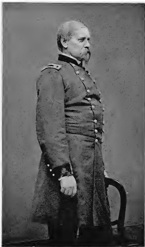
GENERAL W. F. SMITH